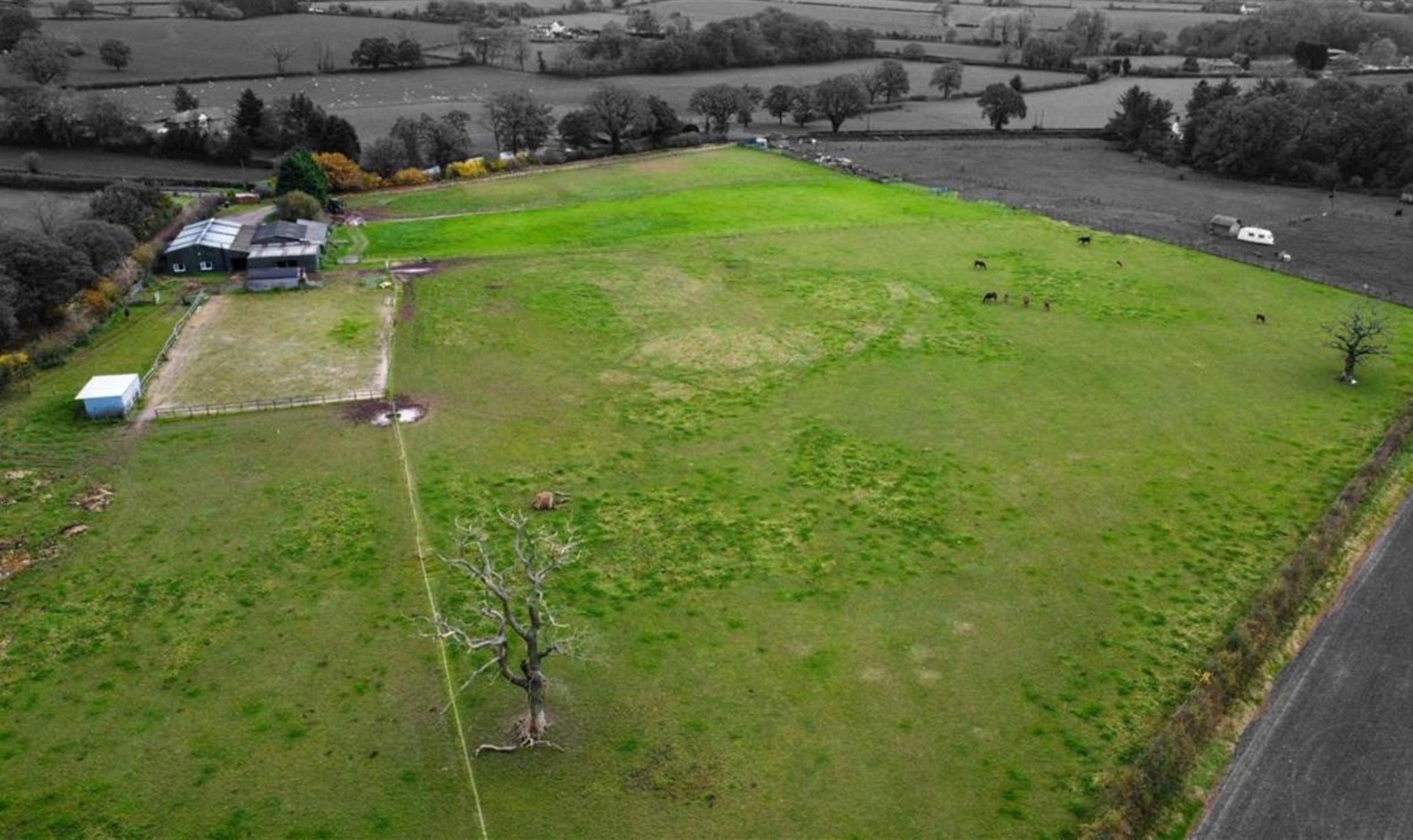
Rainbow Stables, Harriotts Hayes Lane, Codsall Wood, Wolverhampton £595,000